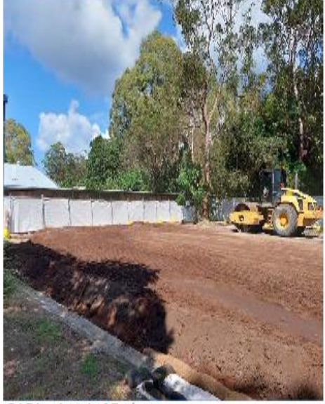
CAPA - Level of Pad