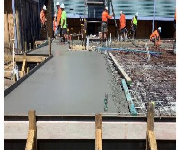
Library - Concrete Pour