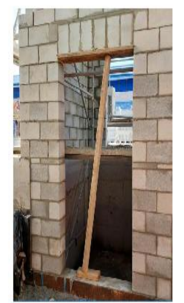
Library - Lift Block Work