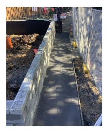
Substation - Concrete Pour