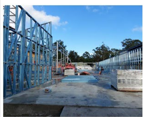
Library - Structural Steel & Lightweight framing