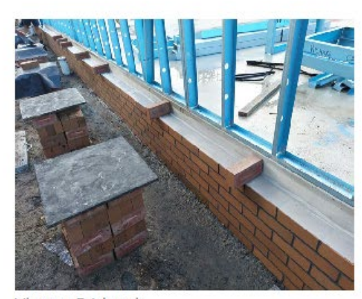
Library - Brickwork