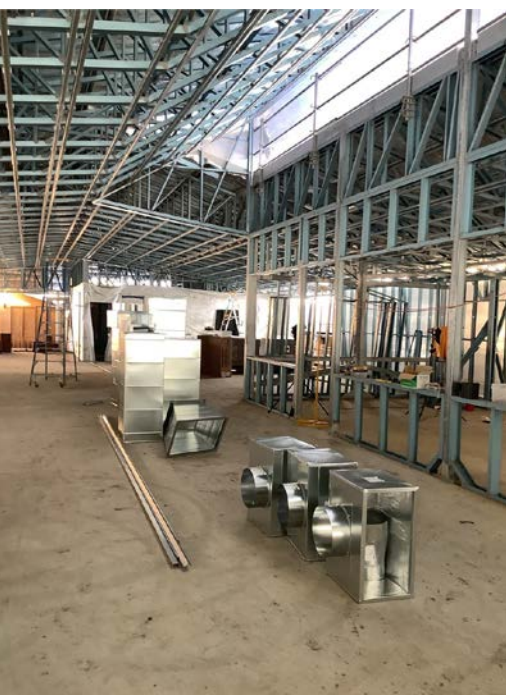
Library - Rough in of Services