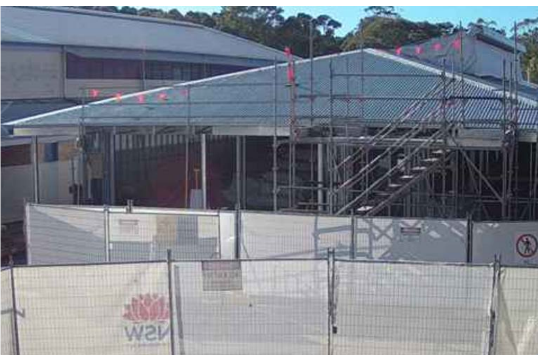
Library - Roof