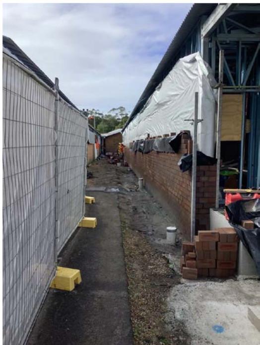
Library - Brickwork