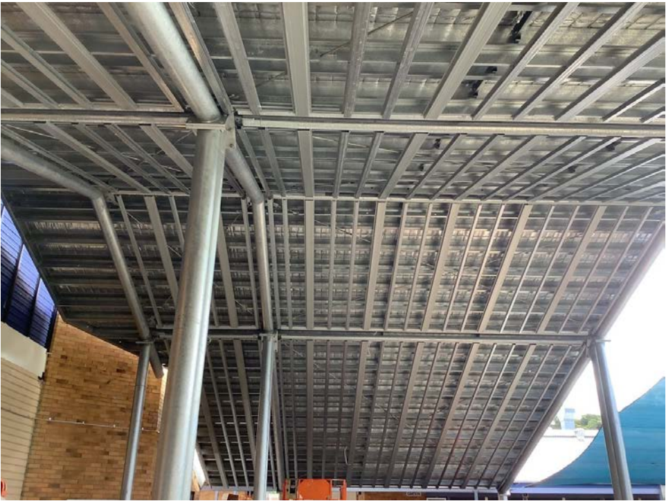
COLA - Soffit

CAPA - Services location/relocation of inground services, complete building pad