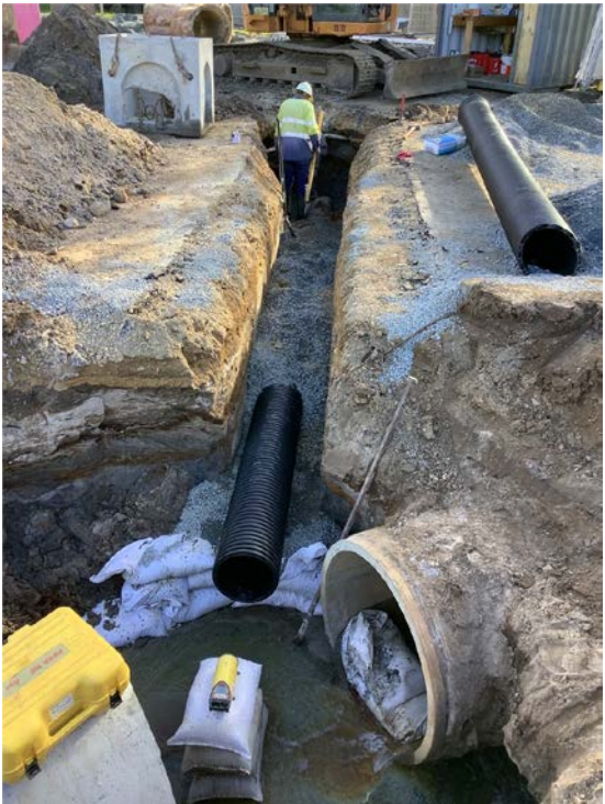
Carpark Civil Stormwater