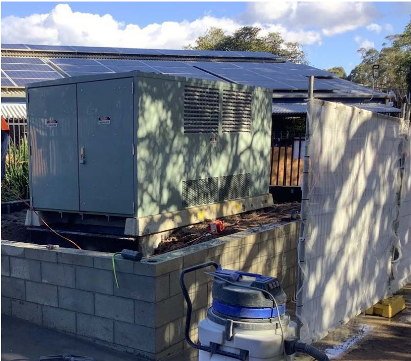
Substation - Backfill