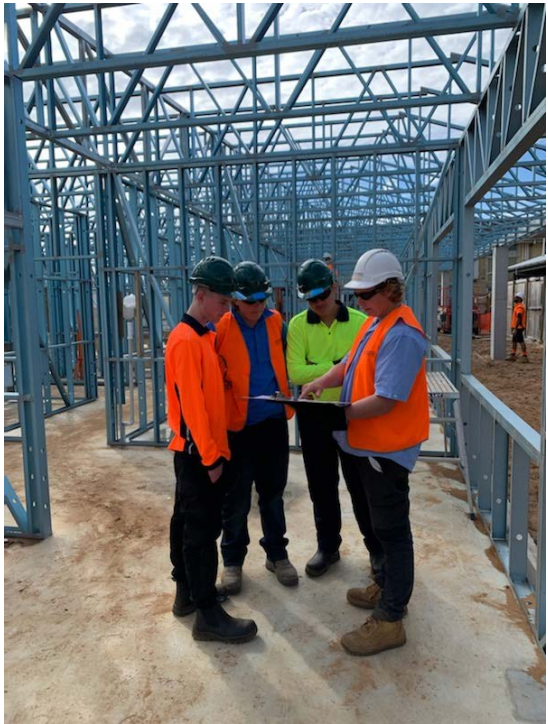
Work Experience: KHS Students and Kingscliff Public School